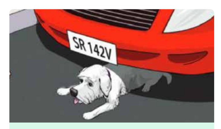
Under/below : Indicates a position below or beneath something.